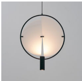
white PC + matt black