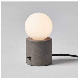
concrete gray + matt opal