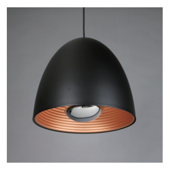
matt black + brushed apricot gold reflector